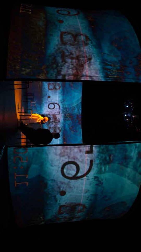
10 Minutes to Midnight