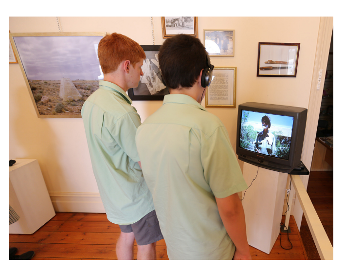
Students enjoying the exhibition, in Balaklava (SA), as part of the 2015 Adelaide Fringe Festival.

Projection installation 10 Minutes to Midnight. The installation's title is inspired by the international Bulletin of Atomic Scientist's Doomsday Clock, which in February 2015 was reset to 3 minutes to midnight acknowledging an increased threat to human existence from unchecked nuclear weapons proliferation and climate change advances.