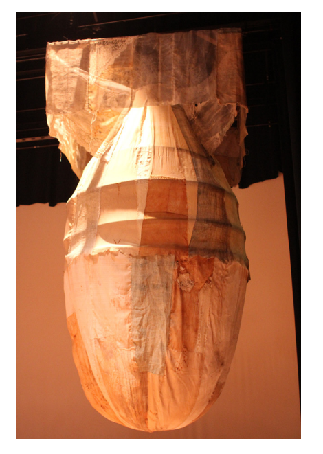
International work exhibited includes third generation Japanese hibakusha (atomic survivor) Yukiyo Kawano's life size silk atomic bomb sculpture - crafted from pieces of translucent kimono fabric and sewn together with strands of her own hair (carrying DNA imprints from the bomb).

Original digital artwork, projection and sound design are integrated with atomic survivor stories from Aboriginal and nuclear veteran communities to bring Australia's chilling atomic history to life.