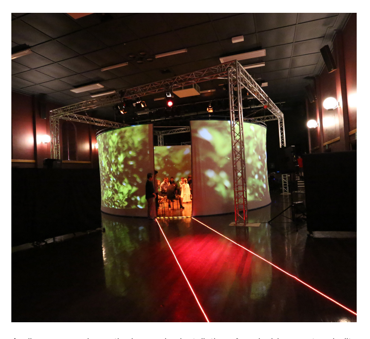
Audiences experience the immersive installations from inside a custom built projection arena.